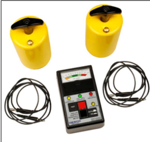
Figure 1. Desco 19784 Analog Surface Resistance Test Kit