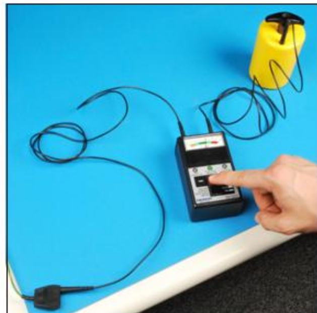
Figure 3. Using the test leads and one 5 pound electrode to measure RTG

CAUTION: If there is a current limiting resistor in the worksurface and the worksurface resistance is lower, the measurement will primarily be the resistance of the resistor. It is recommended to measure RTT particularly if the material color is black.