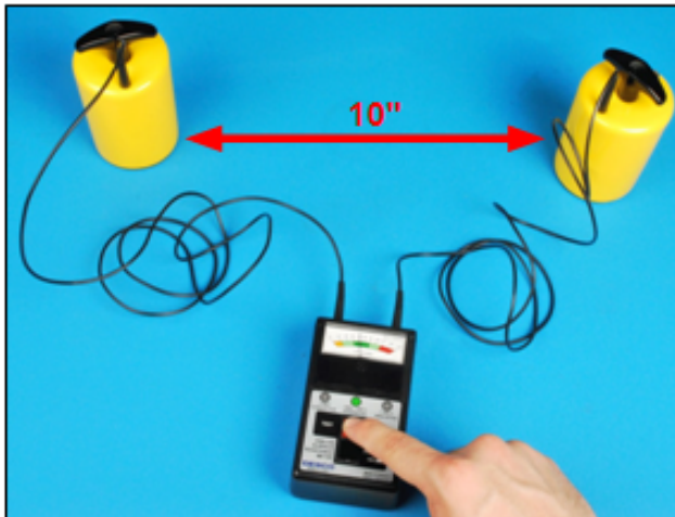
Figure 4. Using the test leads and two 5 pound electrodes to measure RTT of worksurfaces (place electrodes 3 feet apart for flooring)

If the measurement is outside acceptable limits, clean the surface and re-test to determine if the cause of failure is an insulative dirt layer or the ESD worksurface material. NOTE: Use an ESD cleaner containing no insulative silicone (i.e. Desco 10435 Reztore™ Antistatic Surface and Mat Cleaner).